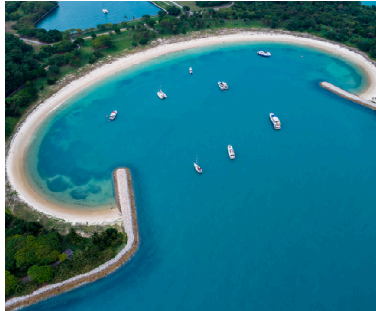
Eagle Bay ($50) For more privacy