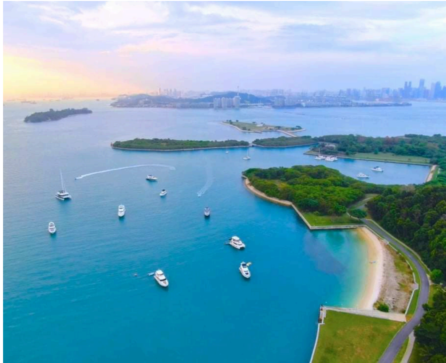
St John's Beach (Default)