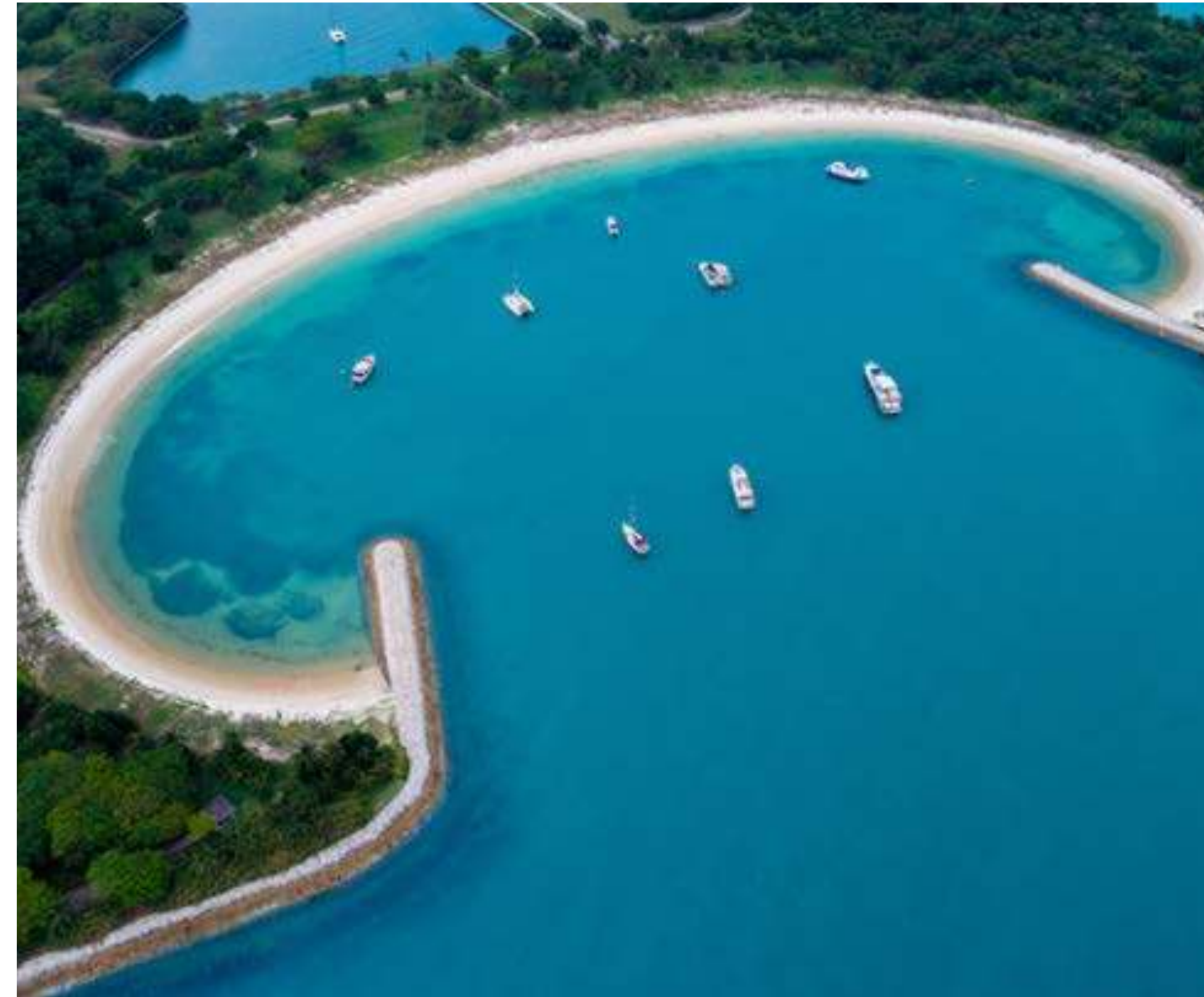
Eagle Bay ($50) For more privacy