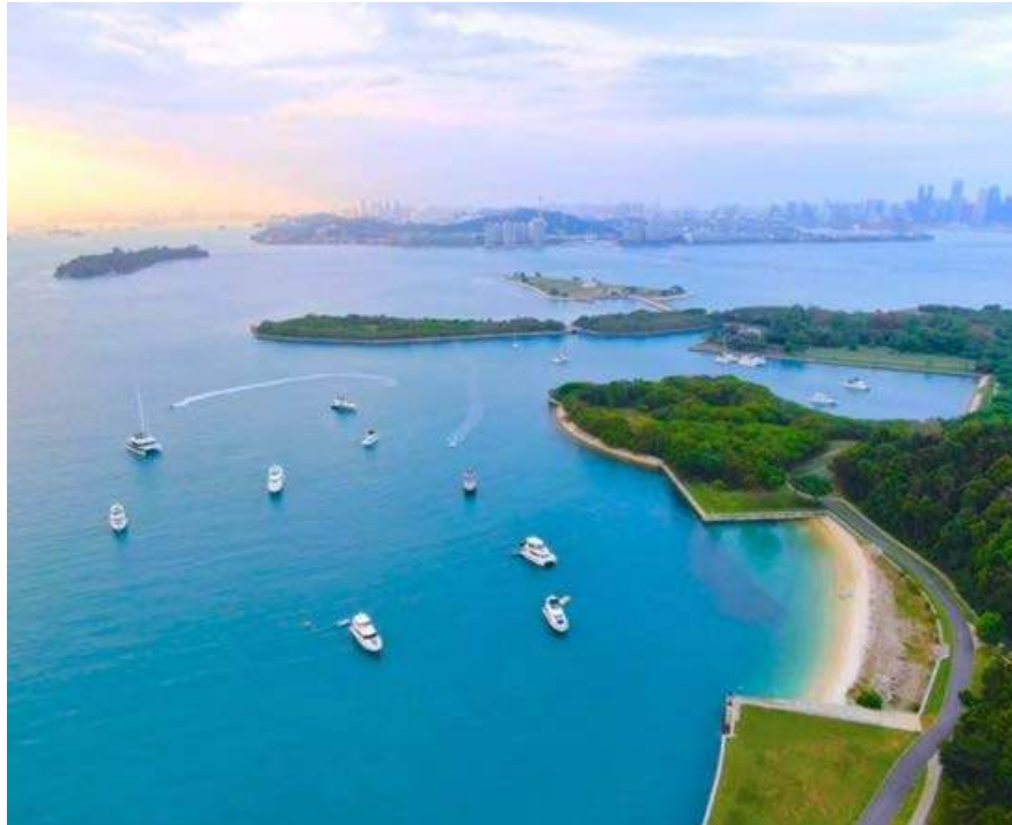
St John's Beach (Default)