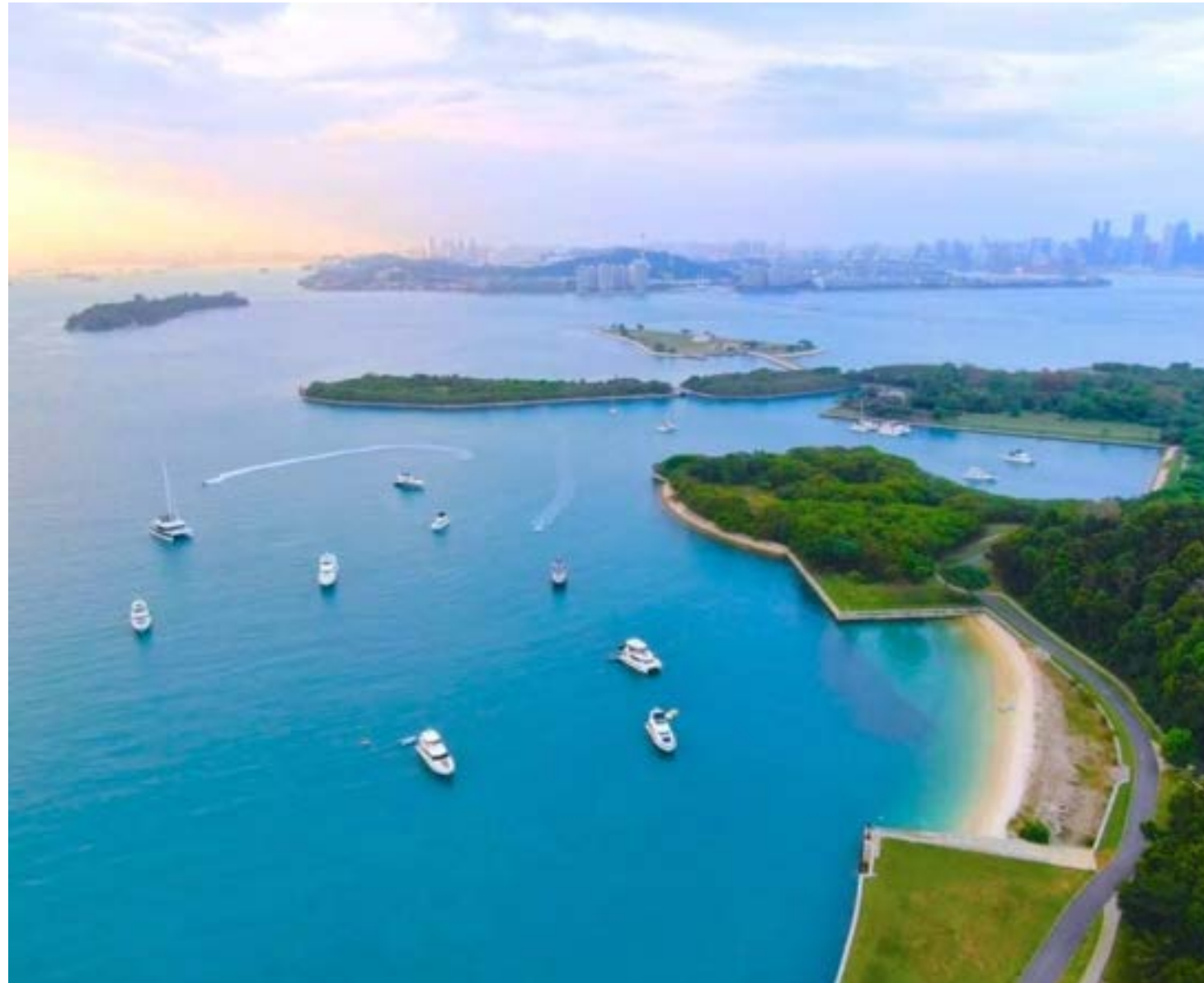
St John's Beach (Default)