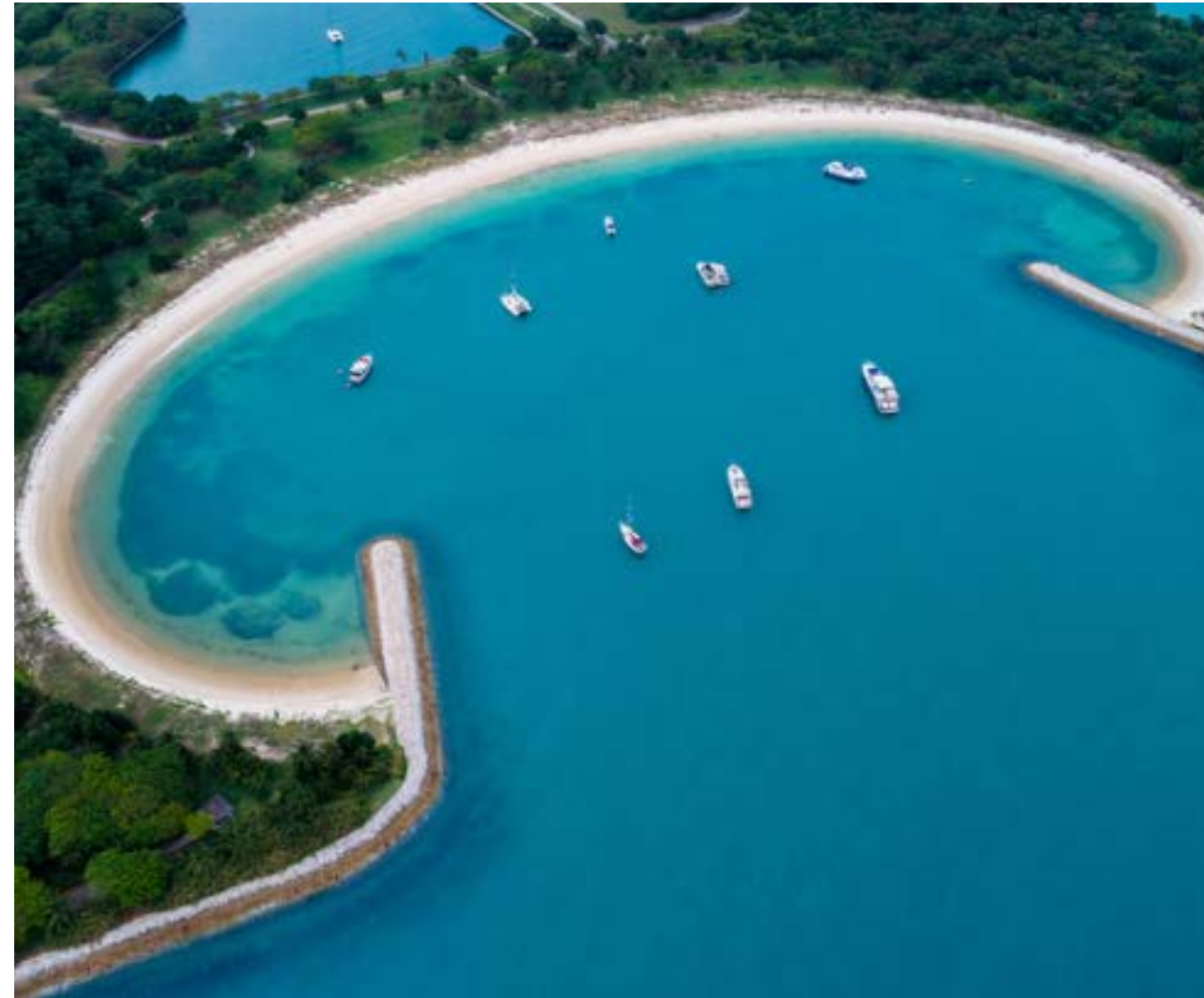
Eagle Bay ($50)